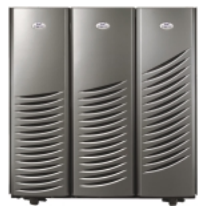
EMC Symmetrix DMX3000